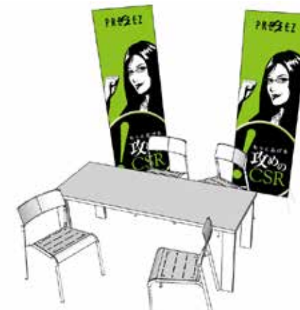
Working place in Kharkiv and Dnipro

The standard furniture of an exhibition stand is as follows: